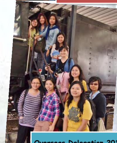
Overseas Delegation 2014 to New Zealand