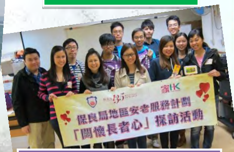
Po Leung Kuk District Elderly Campaign 2013