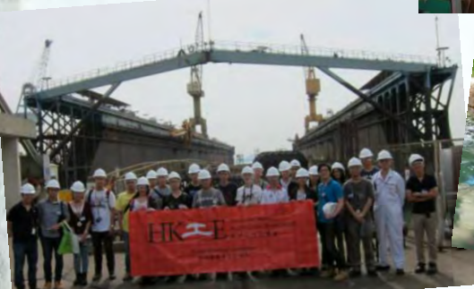
Visit to Hong Kong United Dockyard