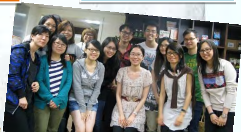
Italian Vegetarian Cooking Workshop