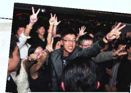
Joint Society Christmas Party 2013