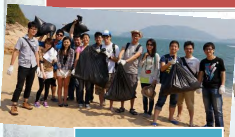
International Coastal Cleanup 2013