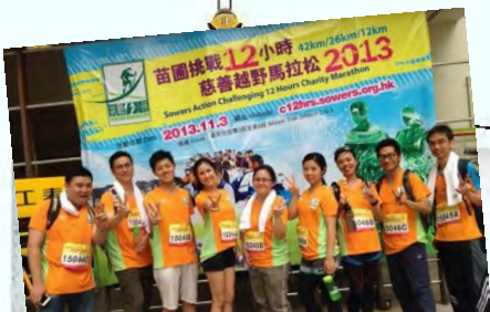
Sowers Action 12 Hours Challenging Charity Marathon 2013