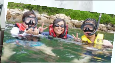
Discover Snorkeling and Marine Conservation