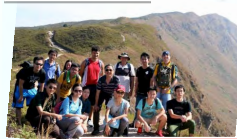
Hiking + BBQ with EAHK