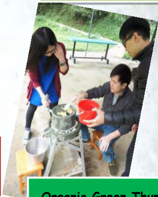
Organic Green Thumb