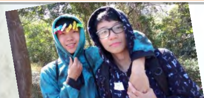
The HKIE-YMC Mentorship Scheme - 1 Day Visit to CUHK