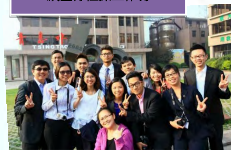
山東省工程文化考察團