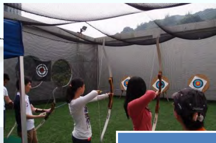
Archery Fun Day