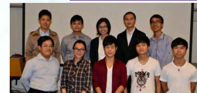
PolyU Professional Talk