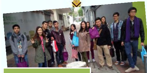
Visit to Homeless People