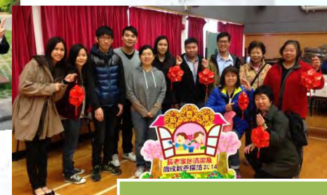
Elderly Home Cleaning