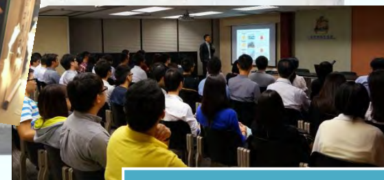
Seminar on Aviation Safety