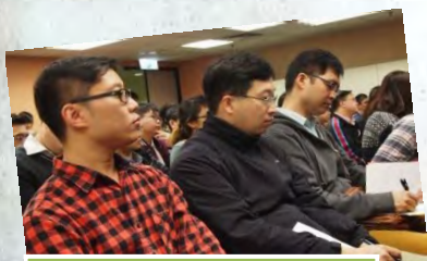
Seminar on Professional Writing Skills