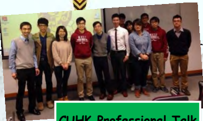
CUHK Professional Talk