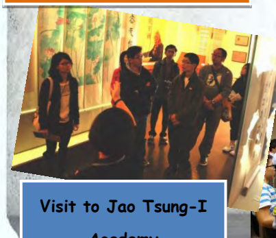
Visit to Jao Tsung-I Academy